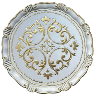
FLORENTINE WHITE Code: