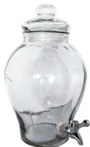
WATER/PUNCH PITCHER Code: FOSE-022