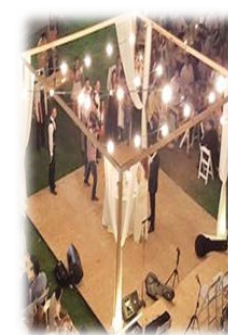
CANOPY FOR WOODEN DANCING STAGE Code: CANOPY-001