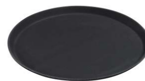
ROUND TRAY Code: FOSE-023