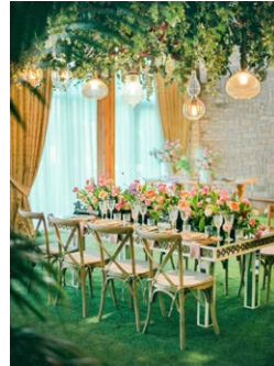
WOODEN FLOWER CANOPY WITH ETHNIC LIGHTS Code: STR-006