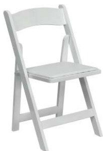
GARDEN FOLDING WHITE Code: CH-004