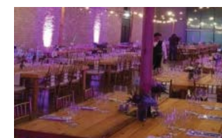
SQUARE WOODEN BASE FOR STRING LIGHTS Size: 150 x 200cm Code: LI-006