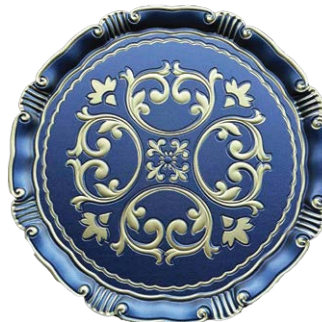
FLORENTINE BLUE Code: TASE-088