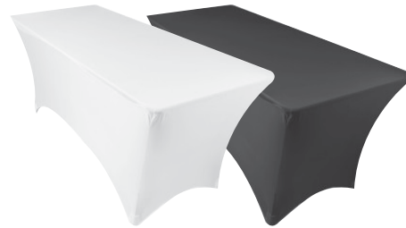
RECTANGLE SPANDEX Size for table: 180x75cm Codes: CL-040 | CL-023