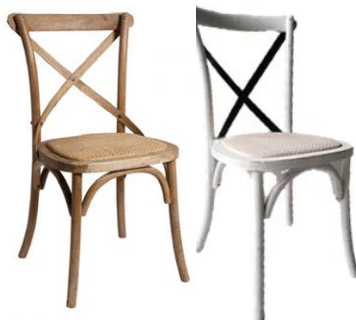
CROSSBACK WOODEN Colors: Natural | White Code: CH-009 | CH-010