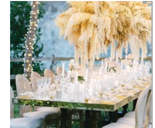
RECTANGLE WOODEN MIRROR TABLE (4 Carved Legs) Size: 240x120cm Code: TA-017