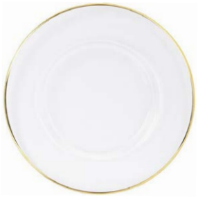
GOLD RIM Code: TASE-007