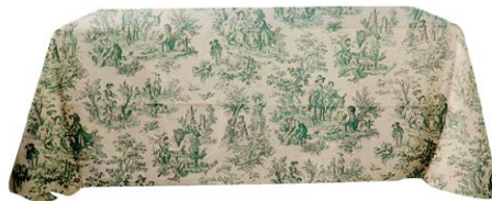
WAVERLY COUNTRY LIFE Color: Green Size for table: 180 x 75cm Code: CL-055