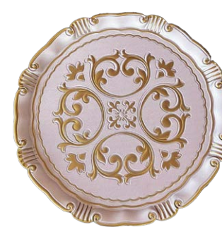
FLORENTINE LIGHT PINK Code: TASE-086