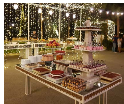
LEBANESE STYLE BUFFET