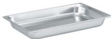
CHAFING PANS Sizes: 1 | 1/2 Code: FOSE-003 | FOSE-004