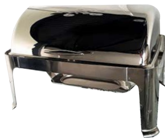
RECTANGLE ROLL CHAFER Code: FOSE-002