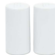
SALT & PEPPER SHAKER (set)