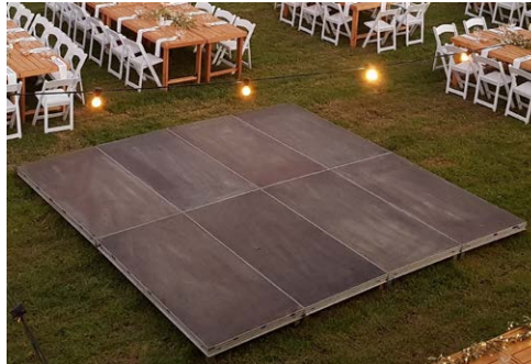
WOODEN STAGE Sizes: 4x4m | 6x4m | 6x6m Codes: STAGE-002 | STAGE-003 | STAGE-004