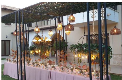
METAL CANOPY FOR HEAD TABLE WITH GOLD DETAILS, ETHNIC ARABIC LIGHTS AND ARTIFICIAL FLOWERS Code: STR-001