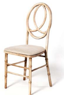
WOODEN PHOENIX Code: CH-017