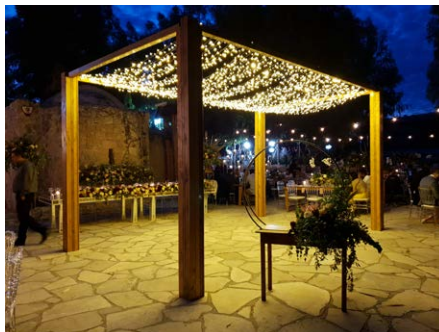
WOODEN CANOPY FOR DANCE FLOOR AREA With fairylights | Without Fairy Lights Code: STR-005