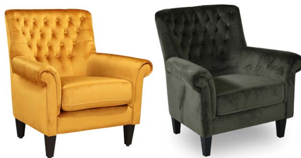
VELVET ARMCHAIR Colors: Mustard | Olive Green Code: CH-019 | CH-020