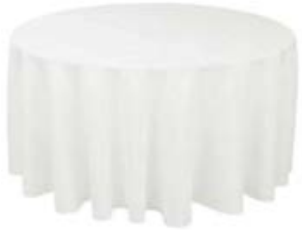
ROUND PLAIN TABLECLOTH Sizes for tables: 180cm | 80cm