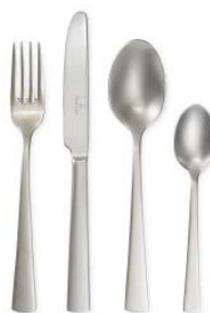
A'CLASS FLAT FLATWARE