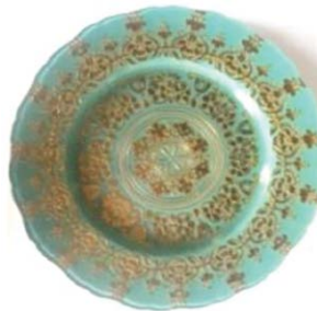
EMERLAND WITH GOLD DETAILS Code: TASE-011