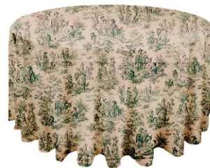
WAVERLY COUNTRY LIFE Color: Green Size for table: 180cm Code: CL-052