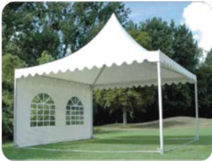
MARQUEE TENT (with window and linen) Sizes: 4x4m | 5x5m Codes: TENT-001