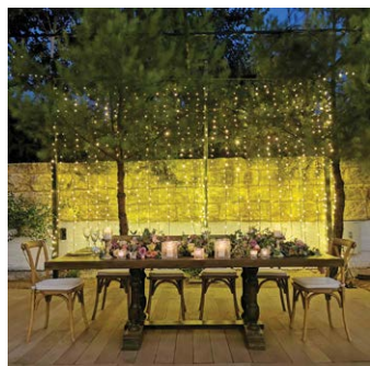
FAIRY LIGHTS CURTAIN Plain Version | Heavy Duty Code: