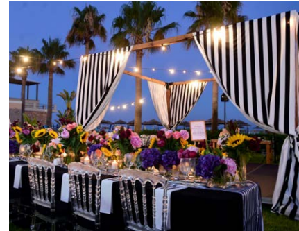
WOODEN CANOPY FOR DANCING STAGE WITH DRAPES Code: CANOPY-001