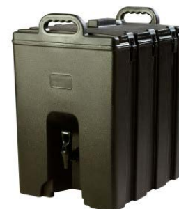
PLASTIC BEVERAGE ISOTHERMAL (for punch) Code: FOSE-025