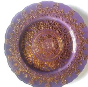
MAUVE WITH GOLD DETAILS Code: TASE-009