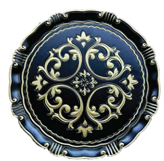
FLORENTINE BLACK Code: TASE-087