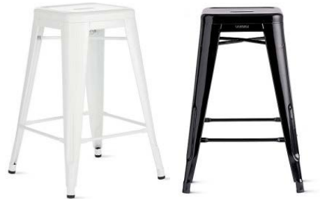
TOLIX STOOL Colors: White | Black Code: CH-008 | CH-007