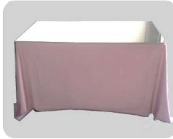
RECTANGLE FULL TABLE MIRROR