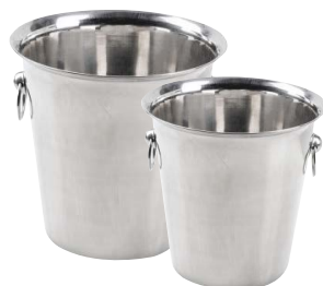
ICE BUCKET Code: FOSE-007 | FOSE-008 Sizes: Whiskey | Champagne