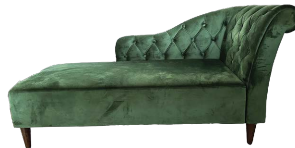
DARK GREEN VELVET SOFA Code: CH-021