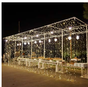
WHITE FAIRY LIGHTS TUNNEL FOR BUFFET Code: DECO-003