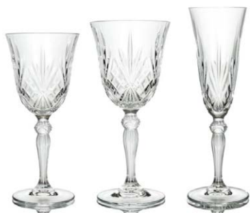
MELODIA CRYSTAL CLEAR SET