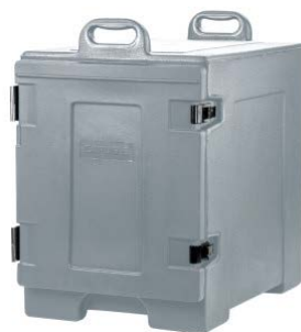
FOOD ISOTHERMAL (NO ELECTRICITY 6 G/N 1/1 6.5cm) Code: FOSE-024