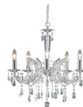
CHANDELIER Code: LI-008