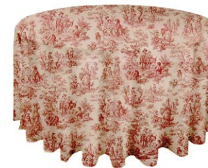
WAVERLY COUNTRY LIFE Color: Red Size for table: 180cm Code: CL-053