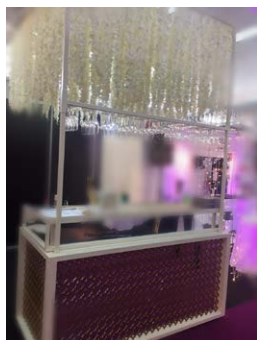
WHITE BAR LEBANESE STYLE