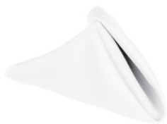
NAPKINS Size: 45x45cm