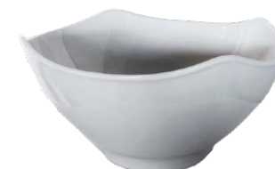
SALAD BOWL MELAMINE Colour: White Code: FOSE-030