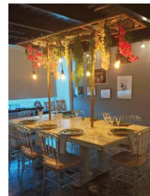
RECTANGLE WOODEN WHITE TABLE WITH METALLIC STRUCTURE AND HANGING LIGHT (4 Carved Legs) Size: 240x120cm Code: TA-022 | TA-024 | TA-025