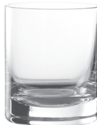
WHISKEY Code: TASE-018