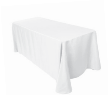
RECTANGLE PLAIN TABLECLOTH Size for table: 180x75cm