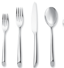
A'CLASS ROUND FLATWARE