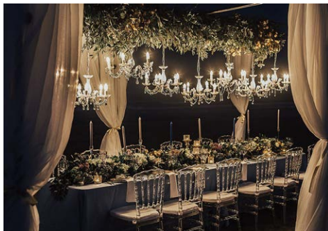
METAL CANOPY WITH CHANDELIERS Code: STR-004