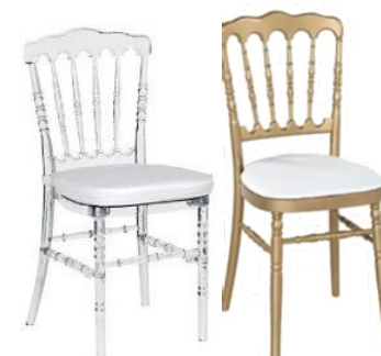
NAPOLEON PLEXI Colors: Transparent | Gold Codes: CH-005 | CH-017