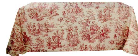
WAVERLY COUNTRY LIFE Color: Red Size for table: 180 x 75cm Code: CL-054