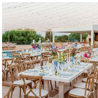
FAIRY LIGHTS Code: