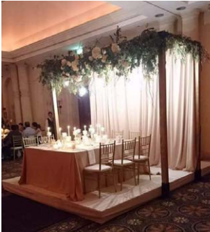
WOODEN CANOPY WITH DRAPE AND LOFT Code: