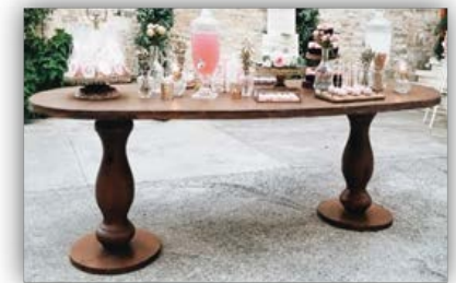
OVAL WOODEN WITH CARVED BASE