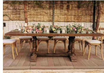
RECTANGLE WOODEN (4 Carved Legs) Size: 240x120cm Code: TA-015