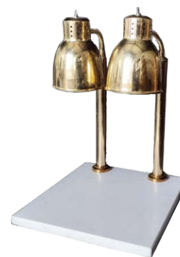
CARVING STATION Code: FOSE-012