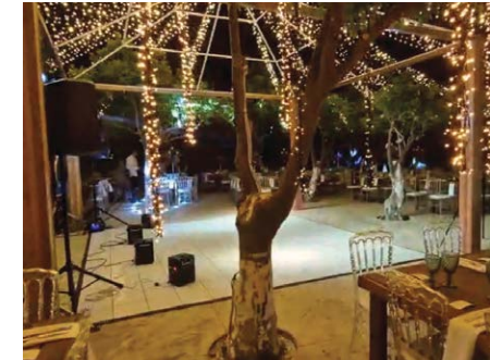
WHITE WOODEN STAGE Sizes: 4x4m | 6x4m | 6x6m Codes: STAGE-005 | STAGE-006 | STAGE-007