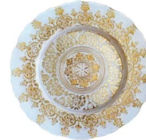
WHITE WITH GOLD DETAILS Code: TASE-010