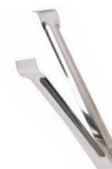
BREAD KNIFE | CAKE SERVER & KNIFE | SERVING FORK | SERVING LADLE | SERVING SPOON | ICE TONG | SERVING TONG Codes: FOSE-013 | FOSE-014 | FOSE-15 | FOSE-016 | FOSE-017 | FOSE-019 | FOSE-018