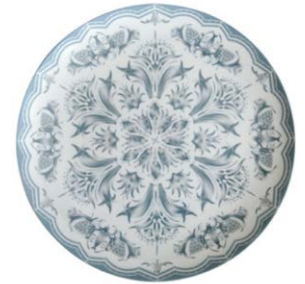
GREY VINTAGE FLORAL Code: TASE-073