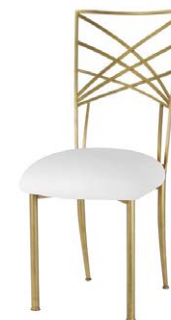
CHAMELEON GOLD Code: CH-011