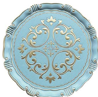
FLORENTINE LIGHT TURQUOISE Code: TASE-085