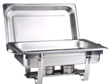
RECTANGLE CHAFER Code: FOSE-001