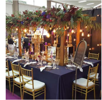
WOODEN STRUCTURE FOR HEAD TABLE WITH EDISON LIGHTS & ARTIFICIAL FLOWERS Code: