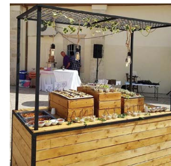
HANDMADE WOODEN BUFFET CART