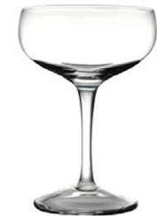
PUNCH Code: TASE-020