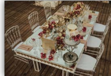
LEBANESE STYLE Size: 220x110cm Code: TA-013