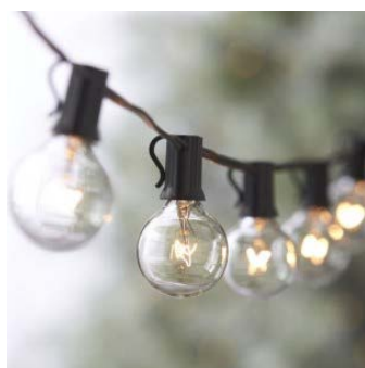
STRING LIGHTS (if poles exist)