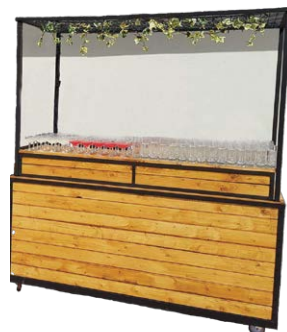
HANDMADE WOODEN BAR CART