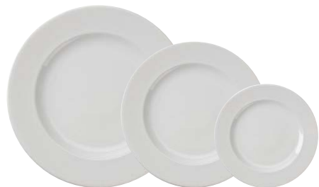
ROUND A' CLASS DINNERWARE