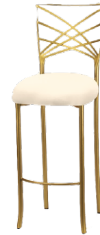
CHAMELEON STOOL GOLD Code: CH-018