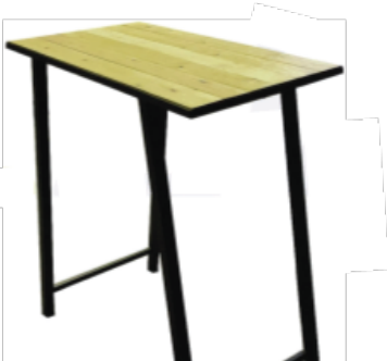
RECTANGLE HIGH TABLE