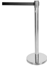
BELT STANCHION Code: B.S-001