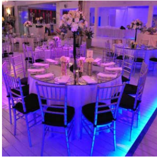
ROUND FULL TABLE MIRROR