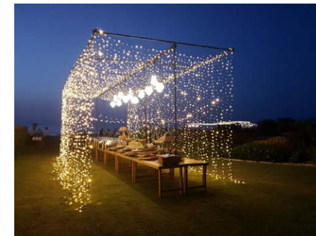
METALLIC TUNNEL Fairy lights | Fairy lights & chandeliers Code: STR-002 | STR-003