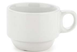
COFFEE/TEA CUP Code: TASE-022