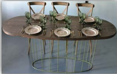
OVAL WOODEN WITH GOLD BASE Size: 240x100cm Code: TA-011