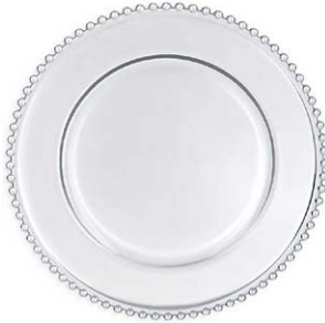
BEADED CLEAR Code: TASE- 008