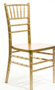
CHIVARY GOLD Code: CH-001