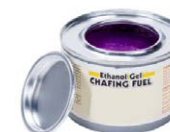
CHAFING FUEL GEL Code: FOSE-005