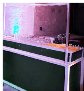
COCKTAIL GREEN BAR