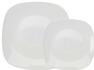
SQUARE A' CLASS DINNERWARE