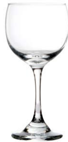
B'CLASS WINE GLASS Size: 26cl Code: TASE-014