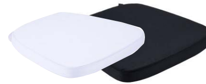
CHAIR CUSHIONS Codes: CL-024 | CL-025